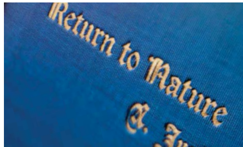
The Bastyr Book Journey