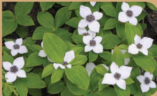
Bunchberry ( Cornus canadensis )