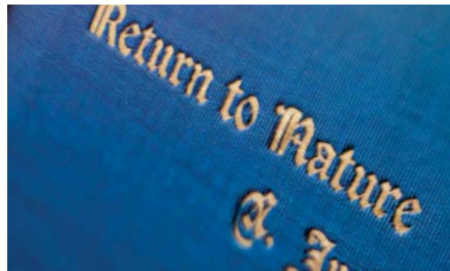
The Bastyr Book Journey