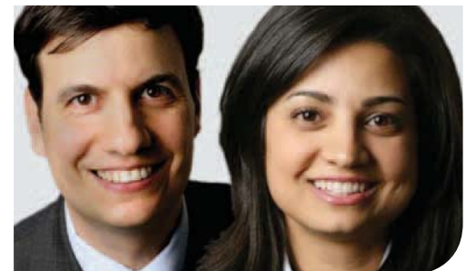
Bastyr University's 2012 Spring for Health Luncheon